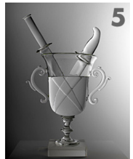
James Drake