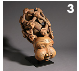
Queen Mothers Pipe Douglas Dawson Gallery, Chicago