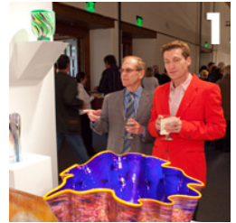
SOFA WEST: Santa Fe 2010 Opening Night