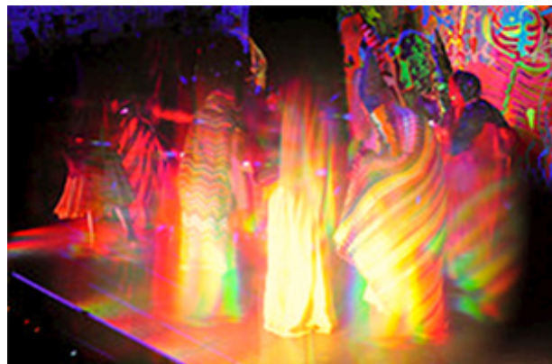
Meow Wolf from The Moon is to Dance on .