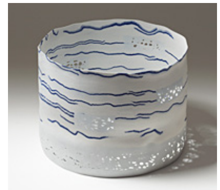
Henk Wolvers Flow Gallery London, UK