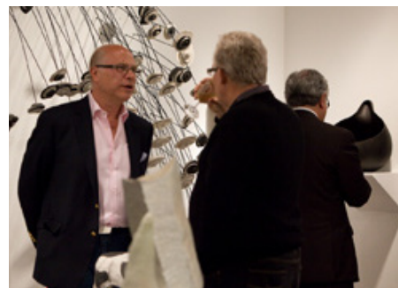
SOFA NEW YORK 2011 Opening Night Preview

New York – With a new design scheme and an exciting roster of international dealers, The Sculpture Objects & Functional Art Fair (SOFA NEW YORK) celebrates its 15 th anniversary on Friday, April 20 through Monday, April 23, 2012 at the Park Avenue Armory, 67 th Street and Park Avenue. The fair’s invitation-only Opening Night VIP Preview is Thursday, April 19 from 5-7 pm, followed by a Public Preview from 7-9 pm by ticket purchase.