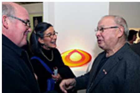
Lino Tagliapietra (right) at SOFA