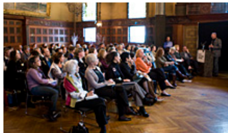
SOFA NEW YORK 2011 Lecture Series

Additional returning galleries of note include: Duane Reed Gallery (St. Louis, MO); Heller Gallery (New York); Jane Sauer Gallery (Santa Fe, NM); Lacoste