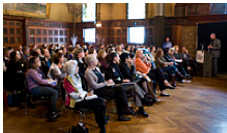
SOFA NEW YORK 2011 Lecture Series