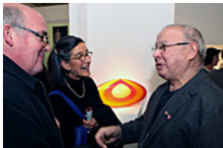
Lino Tagliapietra (right) at SOFA