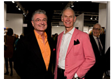
SOFA NEW YORK 2011 Designer Breakfast