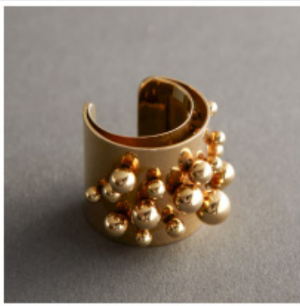
Pol Bury 18K gold ring

The 15th Annual International Sculpture Objects & Functional Art Fair: SOFA NEW YORK 2012 is slated for April 20-23, 2012 at the Park Avenue Armory. The Opening Night Preview Gala will be held Thursday, April 19.