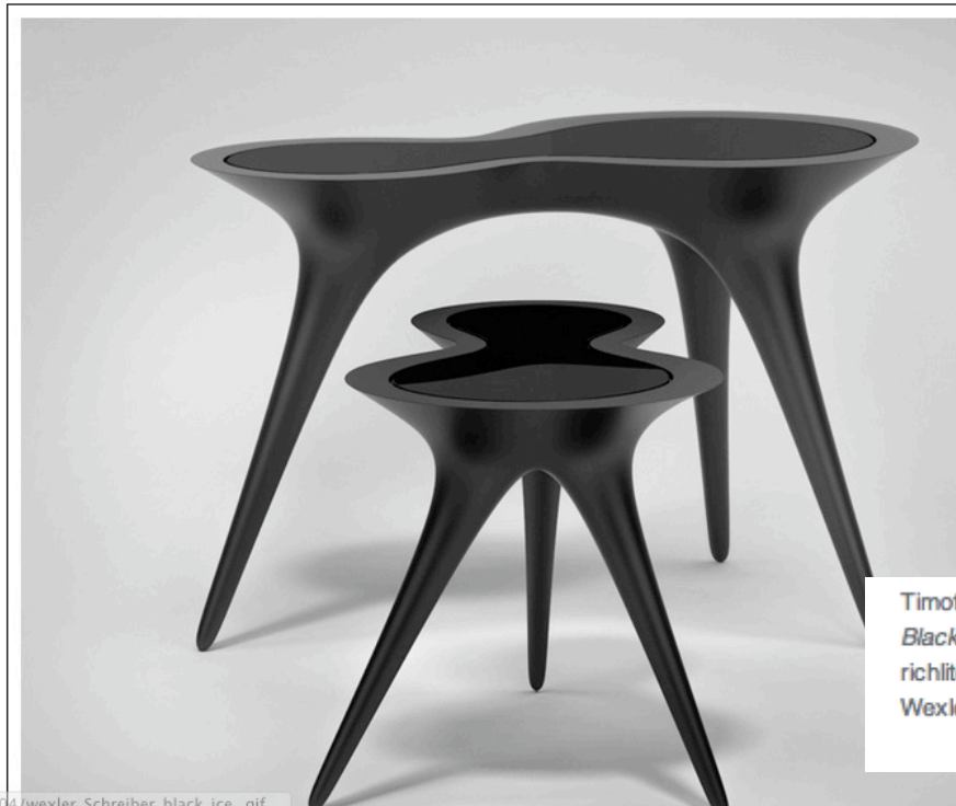
Timothy Schreiber Black Ice Tables richlite material Wexler Gallery

Sofa New York - the 15th edition of the sculpture objects and functional art fair will be open on Friday April 20 -23 at the Park Armory Avenue . The international desing-art exposition is dedicated to promote the worlds of design, decorative and fine art. Works by emerging and established artists and designers will be presented by international galleries and dealers. Here are some of the fair's top highlights: