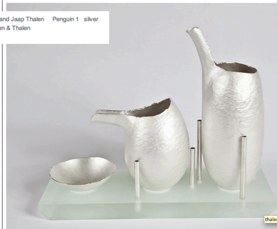
Rob and Jaap Thalen Penguin 1 silver Thalen & Thalen