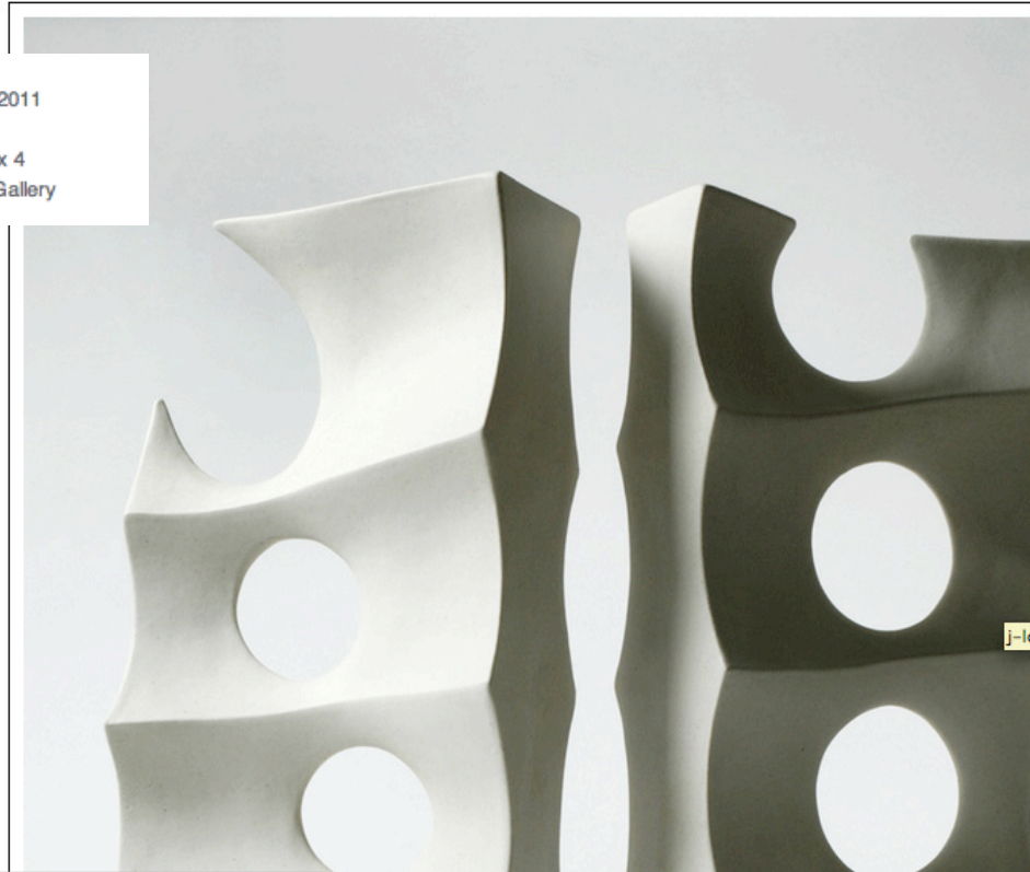
Frank Schillo Ausschnitte , 2011 stoneware 21.75 x 8.25 x 4 J. Lohmann Gallery