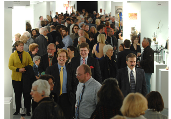
SOFA NEW YORK 2009 Opening Night Preview

New York (Feb. 22): When the Sculpture Objects & Functional Art Fair opens its doors for a four-day run at the Park Avenue Armory with an evening preview on April 15, cutting-edge modern and contemporary design, decorative arts, and jewelry will take front and center stage. Sixty galleries from the United States, Canada, Belgium, Denmark, England, France, Turkey, Japan, and Brazil will come together and push the boundaries of medium and genre, reinforcing SOFA's leading reputation amongst art and design enthusiasts. The pieces on offer, produced by artists and designers from around the globe, go far beyond the traditional decorative arts, not only embracing purely sculptural forms and conceptual meanings, but also new materials and processes.