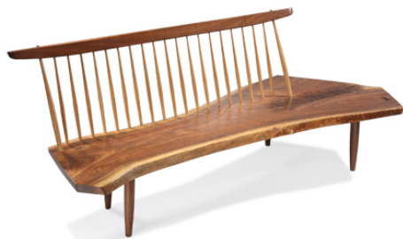
George Nakashima Moderne Gallery