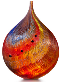
Lino Tagliapietra Heller Gallery