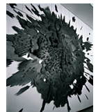
Museum of Arts & Design