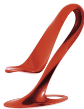
Philipp Aduatz Red Spoon Chair 2008 edition of 12 Galerie Suppan

2010 marks the first time ever that Vienna, Austria-based Galerie Suppan Contemporary will participate in SOFA, and they plan to bring the sleek and sexy work of up-and-coming sculptural object designer Philipp Aduatz . One outstanding exhibition object is the eye-catching "red spoon chair," a remarkable achievement in design, material and technique with the added bonus that it's completely functional as a seat.