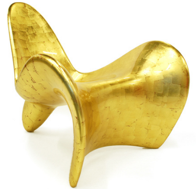
Wendell Castle Morning Sun, Edition of 8, 2009 gilded fiberglass, gold 32 x 33.5 x 36"