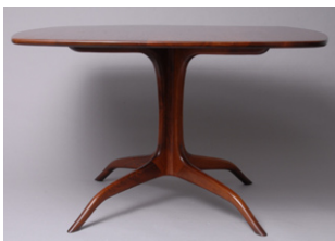
Sam Maloof Pedestal Table , mid 1960's del Mano Gallery

Los Angeles-based del Mano Gallery presents a number of iconic pieces by Sam Maloof , known throughout the world as the definitive master of studio furniture.