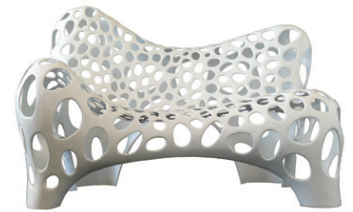
Philipp Aduatz Dormeuse Suppan Contemporary

On track with last year, SOFA CHICAGO 2010 , the annual international Sculpture Objects & Functional Art exposition and Chicago's longest continually running annual art fair, will feature 80 art galleries and dealers from 10 countries. New galleries for this year include: