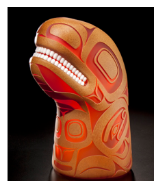
Preston Singletary Deenaa (Fur Seal), 2010 Blue Rain Gallery

A number of premier returning galleries will showcase works by an impressive roster of artists of significant interest in the realm of sculptural objects and functional art. These include: