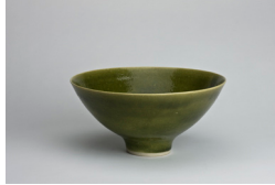
Lucie Rie Galerie Besson