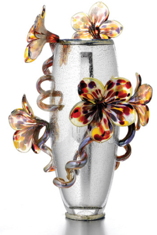
Dale Chihuly Silvered Venetian with Amber and Burgundy Spotted Lilies Litvak Gallery

Litvak Gallery (Tel Aviv, Israel) aims to help leading artists create their own masterpieces and to assist them by promoting their work internationally. The Gallery promotes artists working in different media, but for SOFA CHICAGO 2010 will presents works by world renowned artist Dale Chihuly . The Chihuly exhibition will be titled "Chihuly Silvered" and feature works such as "Turquoise and Crystal Chandelier and Pink and "Silvered Mille Fiori." Chihuly is recognized internationally for his use of color, fluid glass forms and large-scale installations