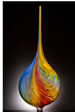
Lino Tagliapietra Maui Schantz Galleries

Formerly Holsten Galleries of Stockbridge, the Massachusetts-based Schantz Galleries continues a 30-year history of representing many of the world's leading artists. For SOFA CHICAGO 2010, the gallery will debut a new sculpture by Lino Tagliapietra. The work, entitled "Saturno Chandelier," is a one-of-a-kind illuminated sculpture that has taken the artist years to create. Tagliapietra is also featured in a special SOFA CHICAGO lecture, "Reflections on the Past 30 Years: A Conversation with Lino Tagliapietra," Friday, Nov. 5 at 9:30 a.m.