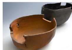
Keiji Ito Ippodo Gallery

The Los Angeles-based del Mano Gallery will present a mix of works including a retrospective exhibit of artist William Hunter . This display will cover several periods and series from the artist's work. Hunter will also be featured in the Saturday, Nov. 6 panel 10 a.m. discussion "Artist and Collector: The Odd Couple" where master artists and major collectors will explore the strong and close relationship between artists and collectors and their influence on each other.