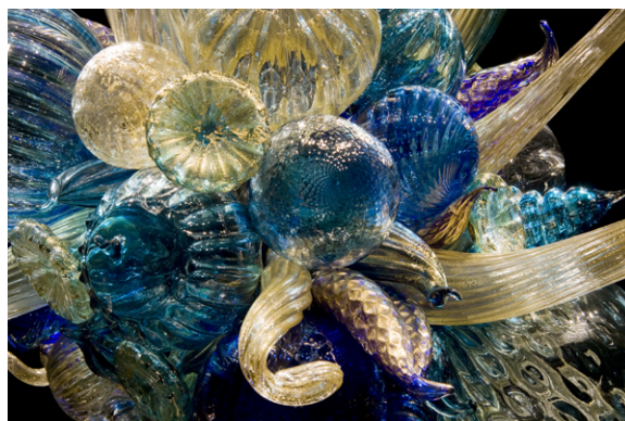
Dale Chihuly Sapphire and Goldleaf Chandelier (detail) , 2008 Holsten Galleries

Can't make it to San Francisco to catch the "Chihuly at the de Young" museum exhibition where the lines are around the block? Then head to Holsten Galleries for museum class examples by that maestro of color, line and form. Among the Chihuly creations on view are his highly complex chandeliers comprised of hundreds of intricately twisting, blown glass components. The artist is revered for establishing blown glass as the basis for both installation and environmental art and his co-founding the Pilchuck School in Washington State, which has trained generations of his glass artists. The work of Chihuly is in the permanent collections of over 200 museums including the Metropolitan Museum of Art, and the Whitney as well as museums abroad such as the Louvre. What's new is that despite a rumbling recession, the market for Chihuly chandeliers like the Cranberry and Ice chandelier, which is seven feet tall and featured at SOFA CHICAGO is booming. "The clientele for Chihuly has grown exponentially and internationally," says Jim Schantz, Holsten Galleries art director, who recently sold a Chihuly chandelier to the New Britain Museum. Founded 30 years ago, Holsten is at the forefront of studio glass and also represents Lino Tagliapietra.