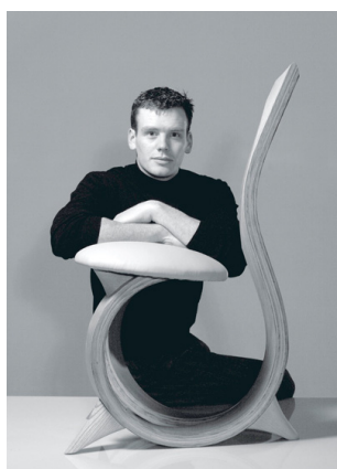
Joseph Walsh National Craft Gallery of Ireland