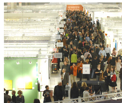
Guests at the Opening Night Preview

SOFA CHICAGO 2008 will be presented in Navy Pier's Festival Hall, 600 E. Grand Ave., Nov. 7-9. Tickets for the Opening Night Gala Preview on Thursday, Nov. 6 from 7 to 9 pm are $50. Fair hours are as follows: Friday, Nov. 7 and Saturday, Nov. 8 from 11 a.m. to 8 p.m., and Sunday, Nov. 9 from noon to 6 p.m. Tickets are $15 for a single day of general admission and $25 for a three-day pass. Student, senior and group tickets are available for discounted prices. Catalogs are $15. For general information, visit sofaexpo.com ; call 800-563-SOFA (7632) or 773-506-8860; or email info@sofaexpo.com . Group discounts are available by telephoning GroupTix at 877-4-GRP-TIX (877-447-7849). Additional information as well as images from the fair last year and art works to be featured at the upcoming fair can be viewed at sofaexpo.com .