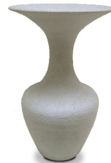
Lucie Rie, Large White Bottle , 1989 Galerie Besson