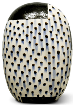
Jun Kaneko Untitled Dango (08-01-02) , 2008 Sherry Leedy Contemporary Art