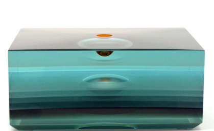
Tom Patti Solarized Blue with Red Echo , 1989-90 Wexler Gallery