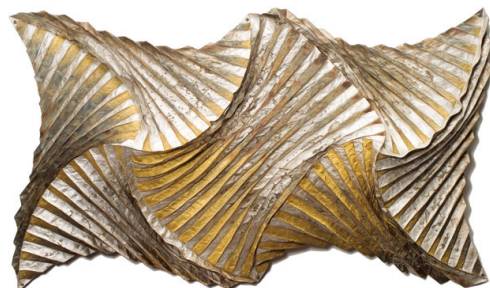
Jin-Sook So Steel Mesh, Untitled , 2007 (detail) browngrotta arts